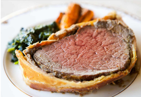
Beef Wellington (made Simple) Submitted by Peas MacCay