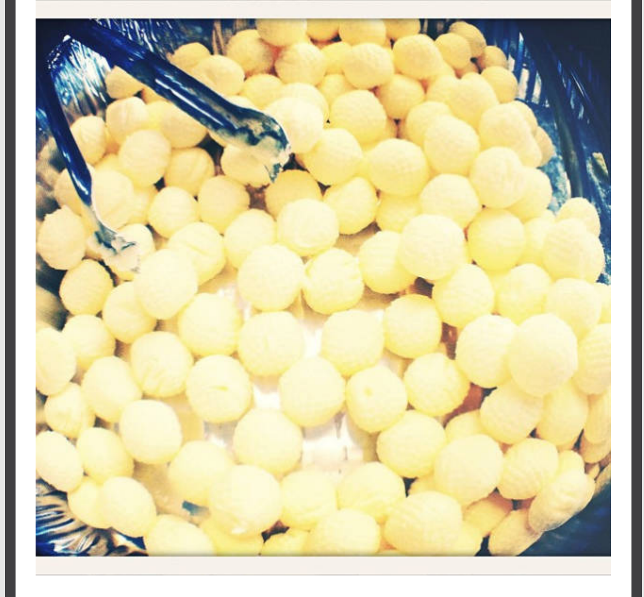
Meaning: To flatter someone History: An ancient Indian custom involved throwing balls of clarified butter at statues of the gods to seek favor.