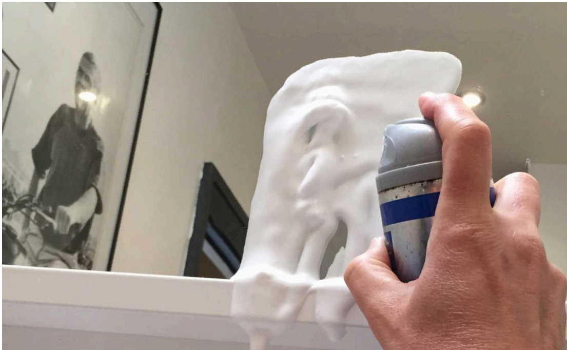
To clean a hazy mirror, use shaving cream